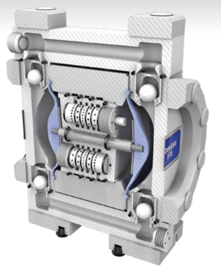
ChemSafe Models: 515, 1040, 1590