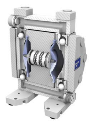
ChemSafe Models: 205, 307