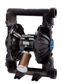
Husky 2150 2 in (50.8 mm) connection Max flow: 150 gpm (568 lpm) Polypropylene, PVDF, aluminum, stainless steel, iron