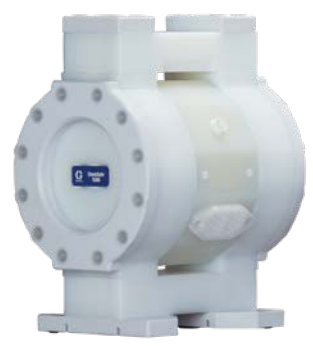
ChemSafe1590 1-1/2 in (38.1 mm) 99.5 gpm (376 lpm)