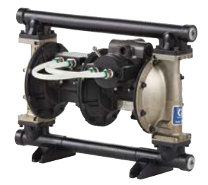
Husky 1050HP 1 in (25.4 mm) connection Max flow: 50 gpm (189 lpm) Aluminum and stainless steel